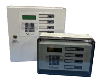
MC100 and MC100-WP Weather proof Master Clock

National Time and Signal www.natsco.net Bulletin C-461 REV A